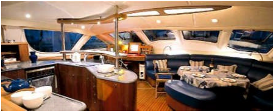
Saloon and Galley

Extremely spacious, with an immense saloon, a fully equipped American style galley a 35m 2 deck salon plus trampoline nets. Agape is the largest and most exclusive cat available for charter in the South Pacific .